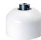
CAS-3000 outdoor housing