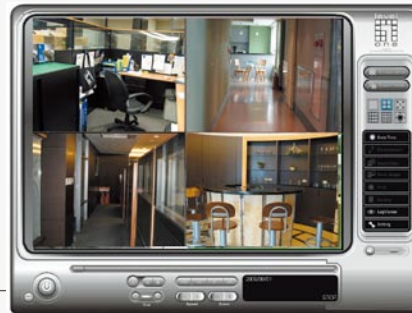
FCS-9100 Series FCS-9200 Series