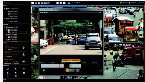
Instant playback in live view window