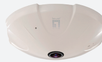
FCS-3091 2-Megapixel Fish-Eye PoE Dome Network Camera