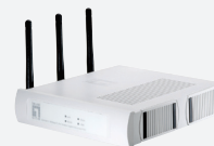
WAP-6012 300Mbps Wireless Gigabit PoE Access Point