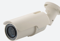
FCS-5061 Day/Night 5-Megapixel PoE Plus Outdoor Network Camera