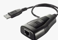
USB-0201 USB 2.0 to Gigabit Ethernet Adapter