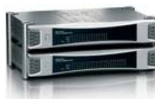
Stackable with Accessory