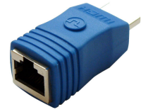
Short Range HDMI Receiver HVE-6000

As simple plug and play devices, there is no configuration required to use these extenders. Also, HVE-7000, HVE-7004, and HVE-7008 all come with a screw mount plate for permanent installations perfect for walls or ceilings in difficult locations.