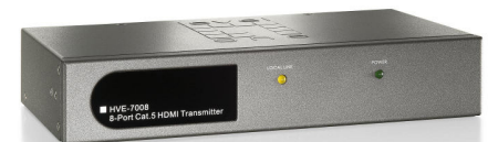
8-port HDMI Transmitter HVE-7008