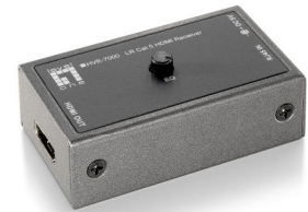
Long Range HDMI Receiver HVE-7000