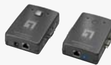
KVM-9005 KVM Cat.5 Extender Kit