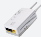
PLI-3411 200Mbps Powerline Wireless Access Point