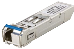
Mini-GBIC BIDI Transceiver 80km