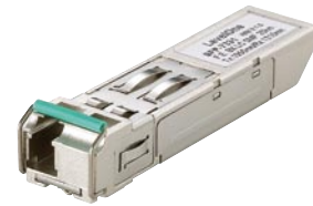
Mini-GBIC BIDI Transceiver 80km