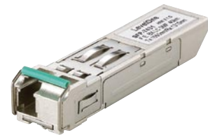
Mini-GBIC BIDI Transceiver 80km