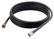
ANC-4230 400 Series N plug to N plug Cable 3m