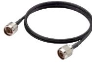
ANC-2210 200 Series N plug to N plug Cable 1m