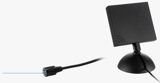
SMA plug Connector

This antenna kit comes with antenna and the 1m ULA-100 extension cable and has been tested for mutually compatible functions with LevelOne's wireless access point, indoor building-to-building bridge and other wireless products equipped with reverse SMA Male Connector and detachable antennas.