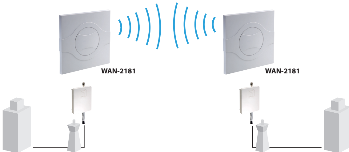
WAN-2181 works with WAB-7000 for Point-to-Point wireless bridging applications