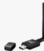
WUA-0614 150Mbps Wireless USB Adapter