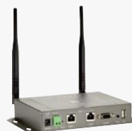
EAP-200 Enterprise Access Point