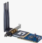
WNC-0600 300Mbps N_One Wireless PCI Card