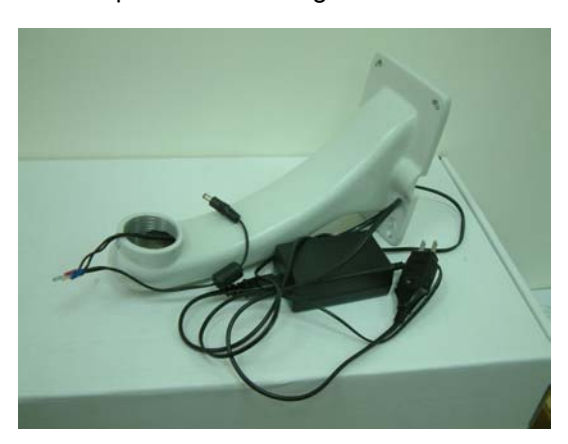
Step 1: Get the power wire through the bracket first.